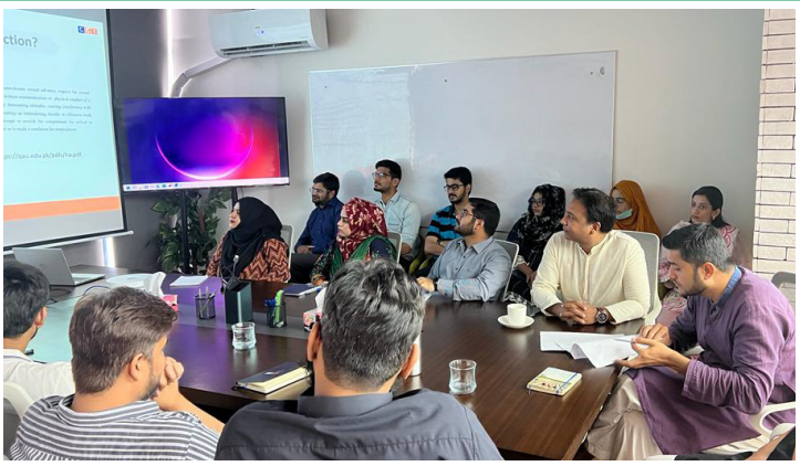
Pakistan Single Window (PSW) is an organization that encourages equality-based work culture and is committed to providing a safe and comfortable work environment to all employees.

In this regard, PSW-Human Resource Department held a training session regarding the Harassment Policy at The Workplace in the Karachi office to provide workplace harassment prevention training to employees to promote a positive work culture. The purpose of this training was to highlight the key aspects of workplace harassment behaviors, reporting mechanisms, and company policy related to harassment so that the PSW workforce can have a safe & secure work environment.